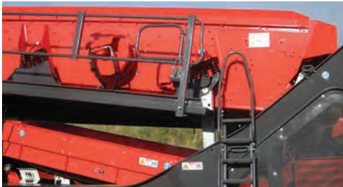
Screen box jack up facility allows easy access