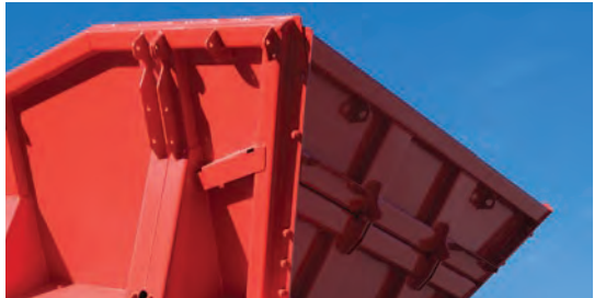
Split rear hopper door for direct feeding