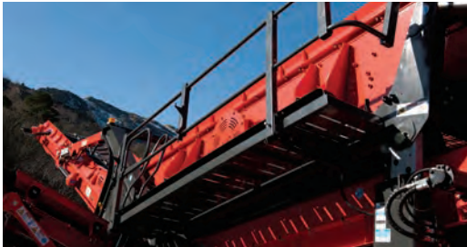
Hydraulically folding maintenance platforms