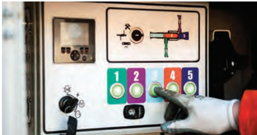
Colour coded control panel for ease of operation