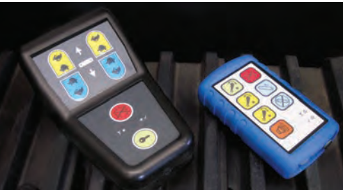
Two-speed tracking and remote control