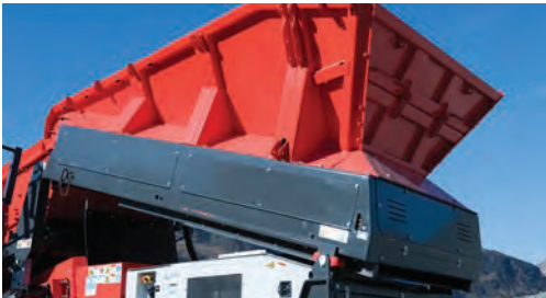
One piece hopper for quick and easy set-up